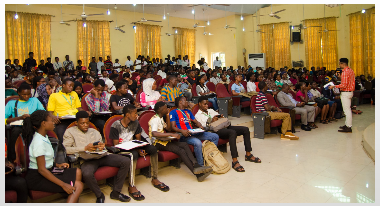
Sahel | Page 8

Human capital development in agriculture is a precondition for successfully revamping current agricultural practices towards social and economic progress. Extra-curricular programmes in agricultural education such as student clubs/ societies and business development groups should be emphasized to further equip students and graduates with much-needed professional exposure. Also, practices from the banking and finance, IT, and FMCG sectors could also be adopted in agriculture. Fostering private-sector-driven graduate training and mentorship programmes for graduates would help in closing the skills gap, improving productivity, and attracting the needed private sector investment to further stimulate economic activities within the sector and economic progress for the nation at large.