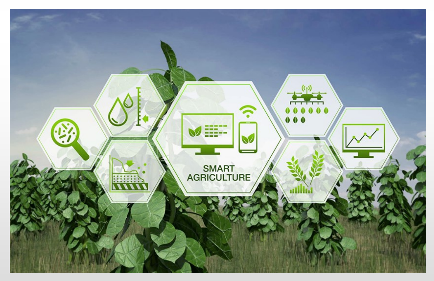
10. Singh, K. M., Shekhar, D. (2015)

Conclusively, while extension services are critical in boosting farm productivity by providing farmers with invaluable technical knowledge, the insufficient number of available extension agents limits the reach of these services, leaving out many rural farmers. Ultimately, this limits the impact of extension services on local productivity. By incorporating ICT in the delivery of extension services, not only will more farmers benefit from the requisite technical information, the information will also be provided in a timely and sustainable