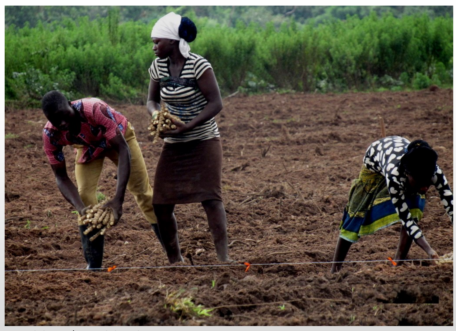
www.sahelcp.com | www.sahelconsult.com

In conclusion, without targeted interventions, talent gaps in the agriculture sector will only become a more pressing challenge. Continued global technological advances ensure that the rate of change in the industry outpace the expectations and capability of even the most experienced actors.