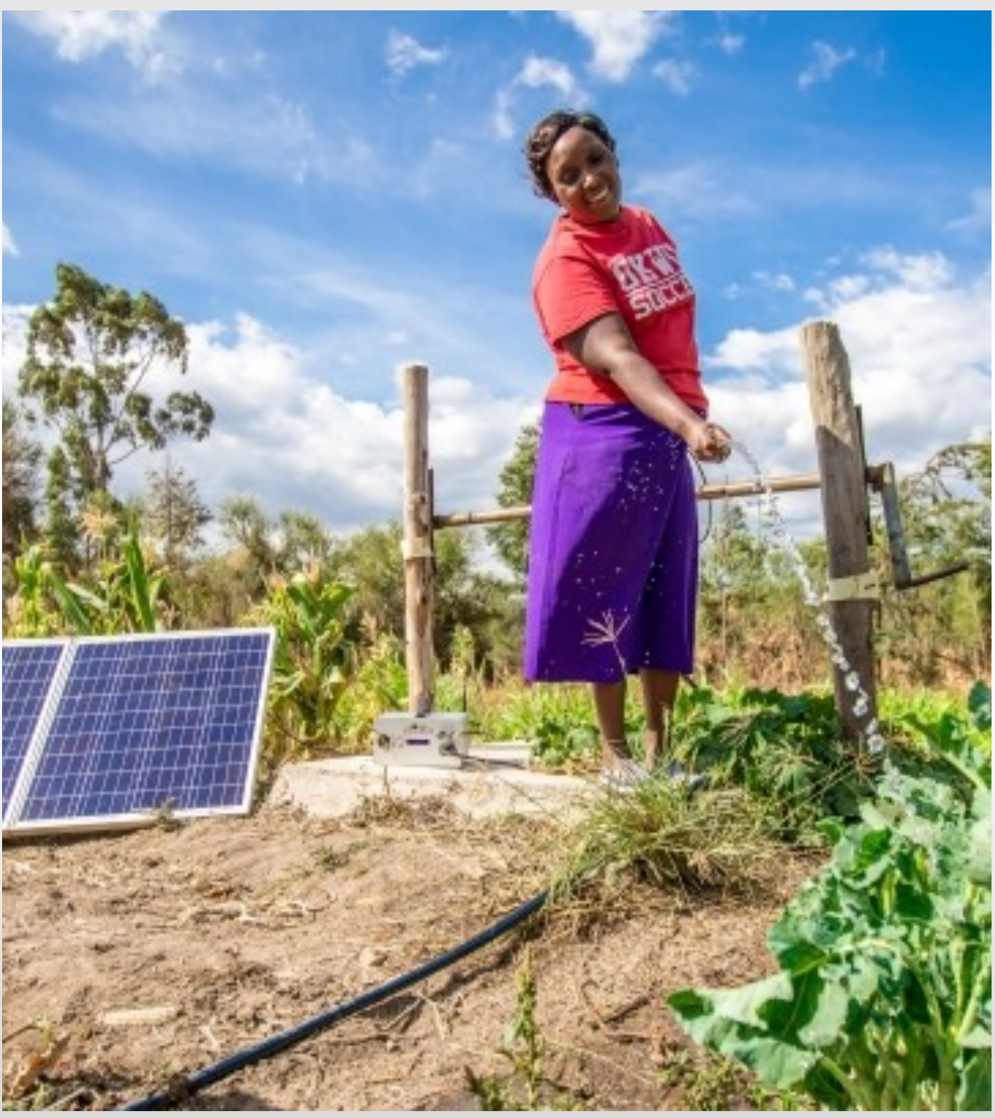
www.sahelcp.com | www.sahelconsult.com | www.nourishingafrica.com

private sector players such as processors, farmers, and input providers adopt climate-smart practices in their activities to reduce greenhouse gas emissions. Research institutes, with financial support from NGOs and development partners, may also develop new innovative technologies powered by renewable energy sources or new and affordable electricity production systems.